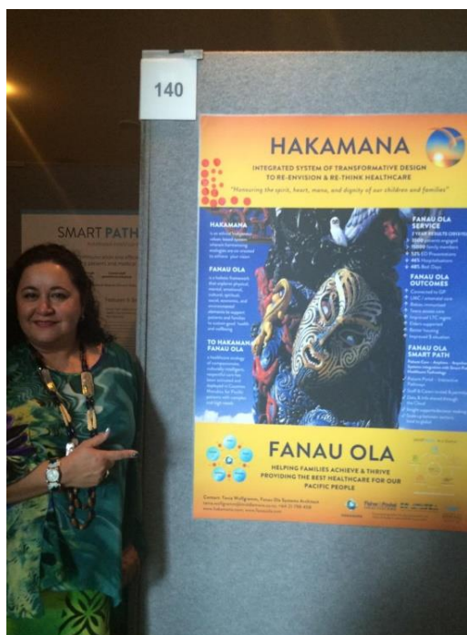
HAKAMANA Methodology for Pacific Fanau Ola