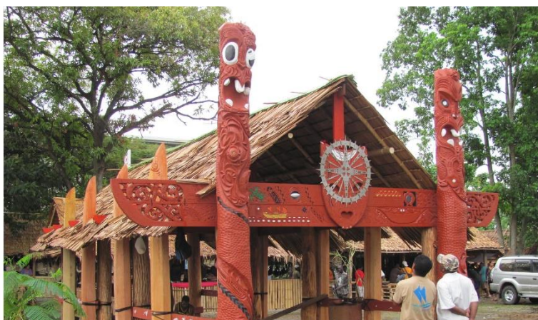
Working with Tōhunga and local artists on Fale Vaka at the 11 th Festival of Pacific Arts, July 2012, Honiara, Solomon