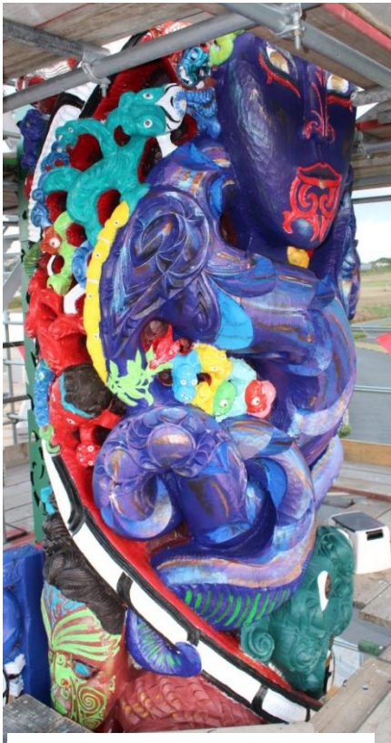
Conservation and Painting of Pou Kapua

Co-Director of the design and creation of Pou Kapua, the largest Māori / Pacific Pou (totem) in the world. Valued at over $ 10 million dollars, Pou Kapua stands 20 metres high, intricately carved from ancient kauri and totara. Standing in Manukau adjacent to the Vodafone Events Centre, Pou Kapua has been experienced by millions of people of all ages and ethnicities from all over Aotearoa and from around the world. See www.poukapua.com