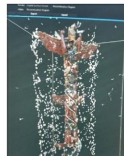
Point Cloud of Pou Kapua

http://poukapua.com/Files/Content/2019/TE_HA_VRAR_Alliance_Profile_Apr_2019.pdf