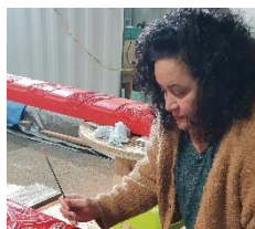
Painting Taniwha on Pou