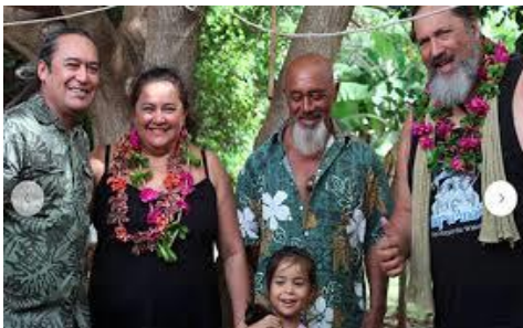
In Rapa Nui with Carvers / Native Speakers