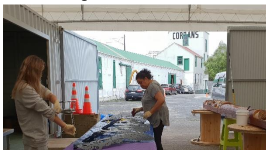
Working with Rangatahi on metal Taniwha