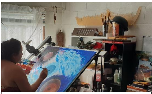
Painting and poetry at home during Covid lockdown