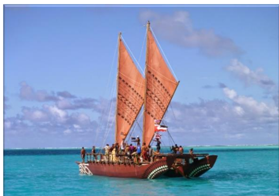
Working as crew member of Haunui Waka in Tahiti

Director, MANA VR , a true virtual reality experience of Pou Kapua, accessible to users via HTC Vive. We have effectively encapsulated reality in all its visual nuance, creating nothing short of a 'being there' sensation for real-time VR applications. This has been the case for thousands of people in Aotearoa and around the world who have experienced MANA VR and its ability to take them from one world, into another. The power of content creation is evident in this virtual reality environment as it provides an opportunity for Māori to tell their own stories and histories through another breakthrough medium. See NVIDIA post https://blogs.nvidia.com/blog/2017/03/03/pou-kapua-vr-experience/